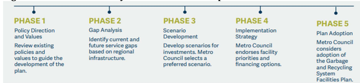
Figure 1. Timeline for the System Facilities Plan Update

In addition to Metro Council, project stakeholders include Metro advisory committees, a community advisory group, and garbage, recycling, and reuse industry stakeholders, as illustrated in Figure 2.