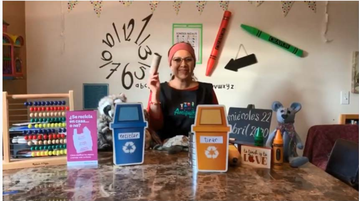
Un juego de reciclaje para el Día de la Tierra

During COVID, focused on supporting virtual engagement methods and reducing disposal barriers.