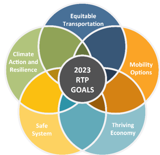
Draft 2023 RTP Goals developed by JPACT and Metro Council

A key next step in the 2023 RTP is updating the near-term and long-term transportation investment priorities for greater Portland. These investment priorities will include two lists of transportation projects that have been prioritized for funding in the near-term (next