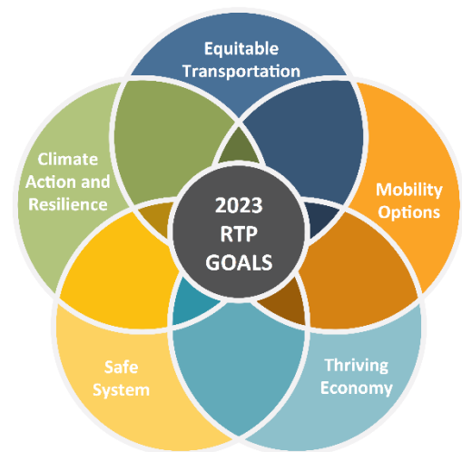
Draft 2023 RTP Goals developed by JPACT and Metro Council

Dramatic changes have unfolded since the RTP was last updated five years ago, many documented in the 2018 RTP Emerging Transportation Trends Study . As greater Portland continues to emerge from the disruptions of the pandemic and respond to other urgent trends and challenges, the 2023 RTP update provides an opportunity for all levels of government to work together to deliver a better transportation future.