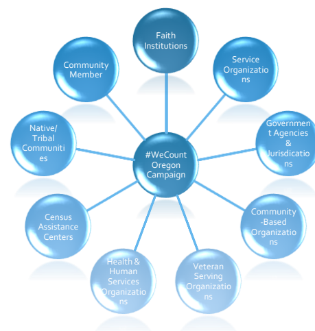
Fig. 4: Hub & Spoke Model

capacity, interest and appetite to support census education and events will be invited to join or host census related activities. Supporters will receive census trainings, community action tool-kits, messaging materials, and opportunities to take action.