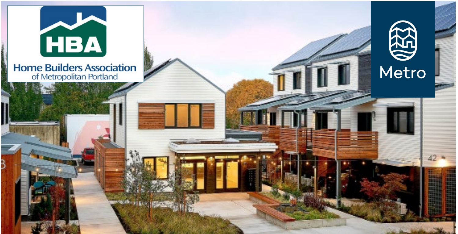
Tillamook Row Zero Energy Community, Green Hammer Design Build.