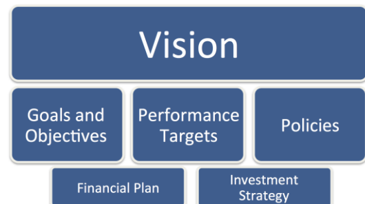
Figure 1. Elements of the Regional Transportation Plan

Together these elements guide planning and investment decisions to meet the transportation needs of the people who live, work and travel in greater Portland today and in the future.