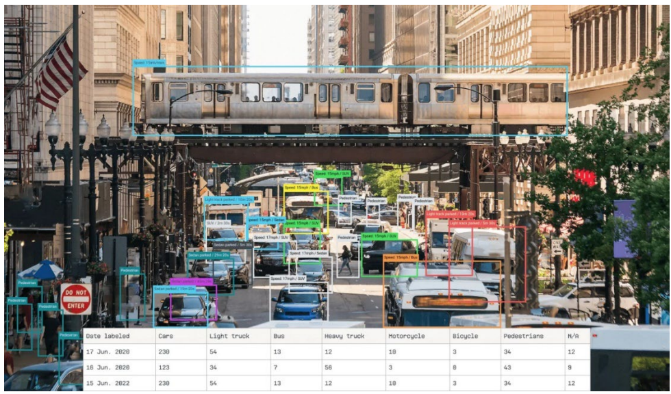
Figure 1: Example photo from the traffic video system, image not taken in San José. The system records the relevant data into a table, like the one shown in the bottom of the image, and deletes the image unless a safety incident was recorded.

In the event of safety incidents (e.g., speeding or near misses) the system can record images and video clips not to exceed 10 seconds to provide visual confirmation of the captured events and ensure accurate data collection. Figure 2 shows examples of safety incidences recorded by the cameras.