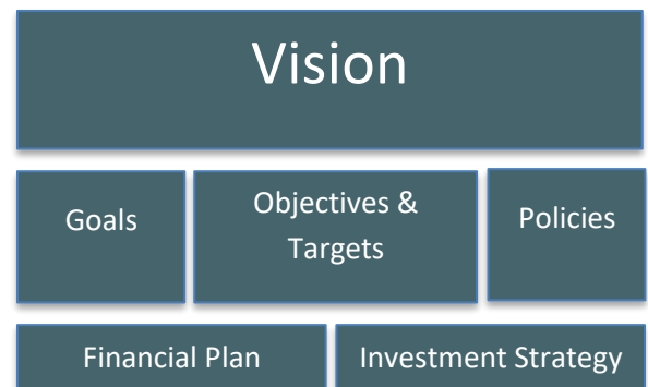
Figure 1. 2023 RTP outcomes-based planning approach

Figure 1 shows the elements of this outcomes-based approach.