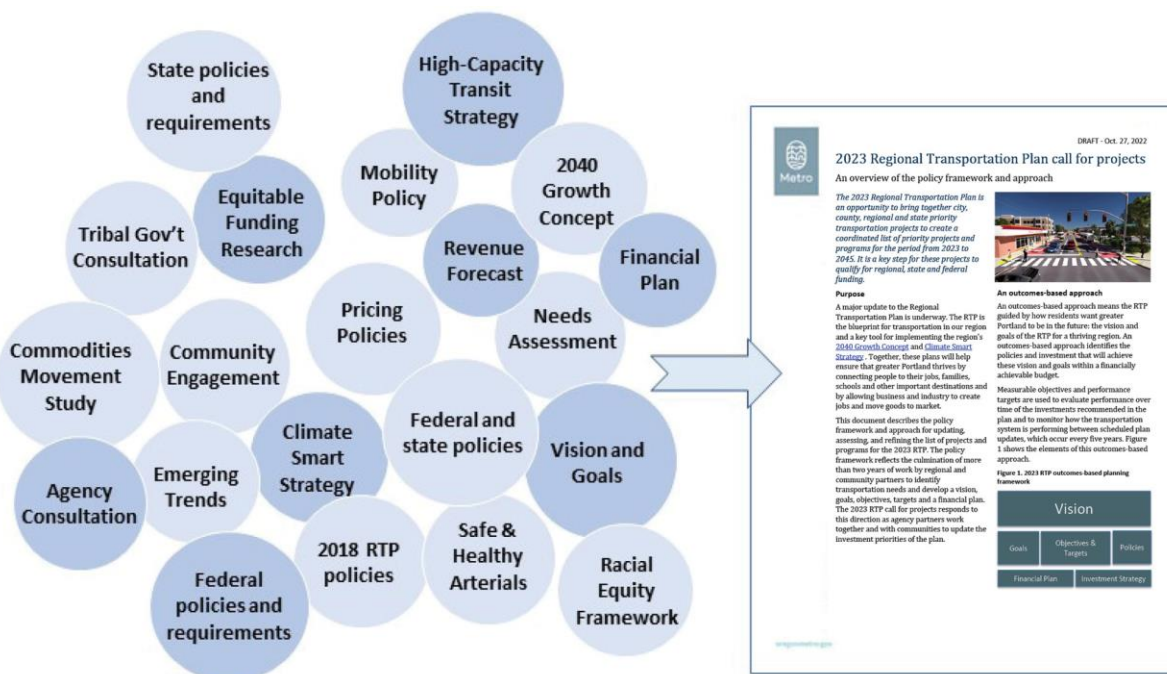
Figure 3. Elements informing the 2023 RTP call for projects

These elements come together to inform the policy framework for call for projects and provide additional information to guide how investments in roads, bridges, bikeways, sidewalks, transit service and other needs are addressed and prioritized. The elements reflect extensive engagement with local elected officials, public agencies, Tribal governments, community-based organizations, business groups and the community at large.