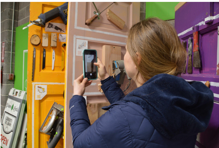
Scanning a QR code for tool instructions at Green Lents

Green Lents used an Investment and Innovation grant to expand access to the community tool library by removing barriers for residents that speak a language other than English at home. Staff developed educational and outreach materials using videos, illustration, and infographics to convey information without relying as much on written text. New signage and instructional displays in the tool library make it easy for anyone to find the right tools and learn how to use them safely.