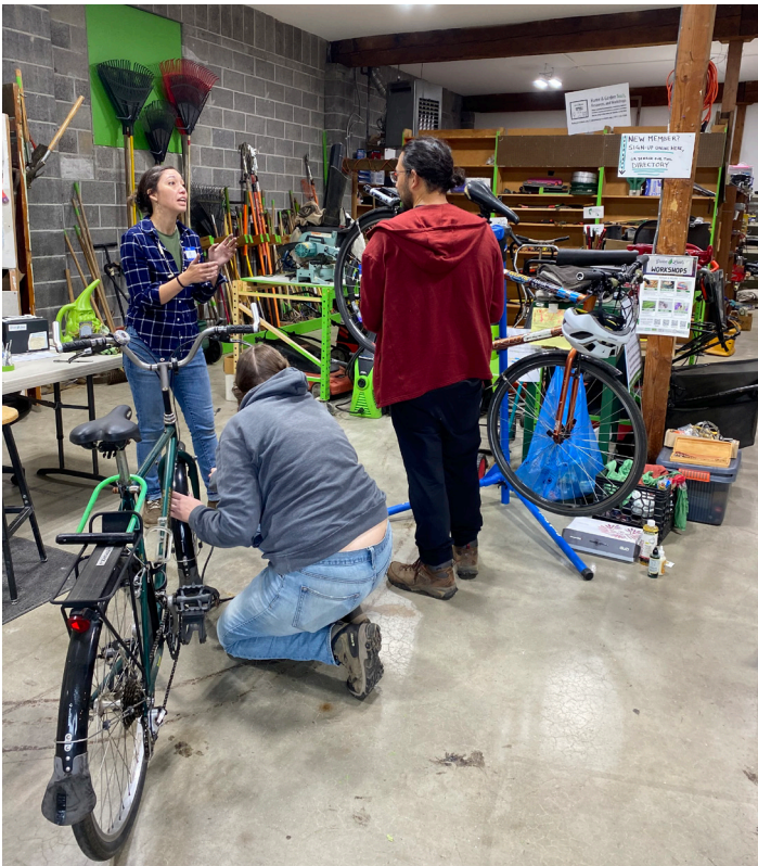
Bicycle repair workshop at Green Lents

communities of color, immigrants and low-income families. Tool libraries help communities reduce waste and save money by offering a wide variety of tools for home and garden projects that can be borrowed at no cost to members.