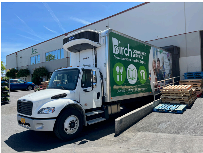
Birch Community Services' new refrigerated truck

For more than a decade, Green Lents has worked to build resilience in the greater Lents area through community outreach, engagement, education, and resource sharing. The organization runs a community tool library serving Lents and surrounding neighborhoods in East Portland, which include diverse