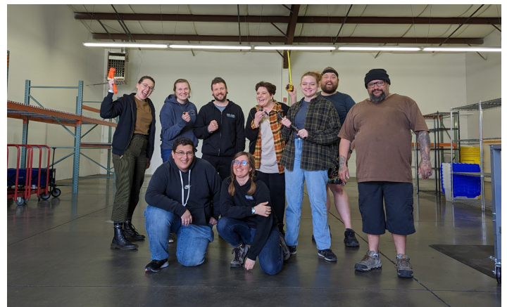
Community Warehouse team celebrating the new Gresham warehouse

Community Warehouse provides donated furniture and household items to neighbors seeking the comfort and dignity of a furnished home while overcoming adversity. With support from an Investment and Innovation grant, the organization expanded into Gresham with a new donation center in April 2023. This is the organization's third location and brings important services to an underserved part of the region. The project was a collaboration with ReClaim It!, providing a space for other reuse organizations to co-locate and share resources for reuse and repair.