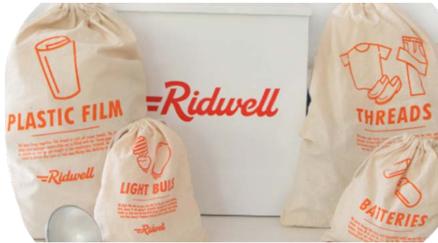
Collection bags and bin provided to customers by Ridwell.

The existing Ridwell facility receives source-separated recyclable materials, reusable materials, and certain special wastes (such as a batteries and lightbulbs) that are collected as part of Ridwell's subscription service. Ridwell provides doorstep collection of hard-to-recycle items including plastic film, multi-layer plastics, batteries, light bulbs, clothing, plastic clamshell takeout containers, Styrofoam, as well as a rotating category of reusable items such as handheld tools, bike accessories and holiday lights for the purpose of reuse or recycling. Generators source-separate items into cloth or plastic bags provided by Ridwell and place the bags into or near the Ridwell-provided doorstep bin on the day of collection.