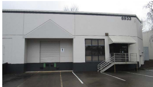
Ridwell Portland Warehouse - 8933 NE Marx Dr., Suite C, Portland

The collected materials are transported to the Ridwell Portland Warehouse, where they are sorted, screened for unacceptable waste and consolidated for transport to reuse and recycling markets. To minimize risk of fires and release of toxins due to breakage, special waste management plans approved by the Oregon Department of Environmental Quality (DEQ) are in place for household batteries, lightbulbs, and covered electronic devices as defined in ORS 459A.305. The facility has two balers in place to mechanically compact plastic film and other plastics for more efficient storage and transport. The facility then transports the recyclable materials to local and national markets or partner reuse organizations as identified on Ridwell's website at Ridwell.com/transparency . The facility separates any non-recyclable waste that it inadvertently receives and disposes it through standard commercial waste collection service in the city of Portland.