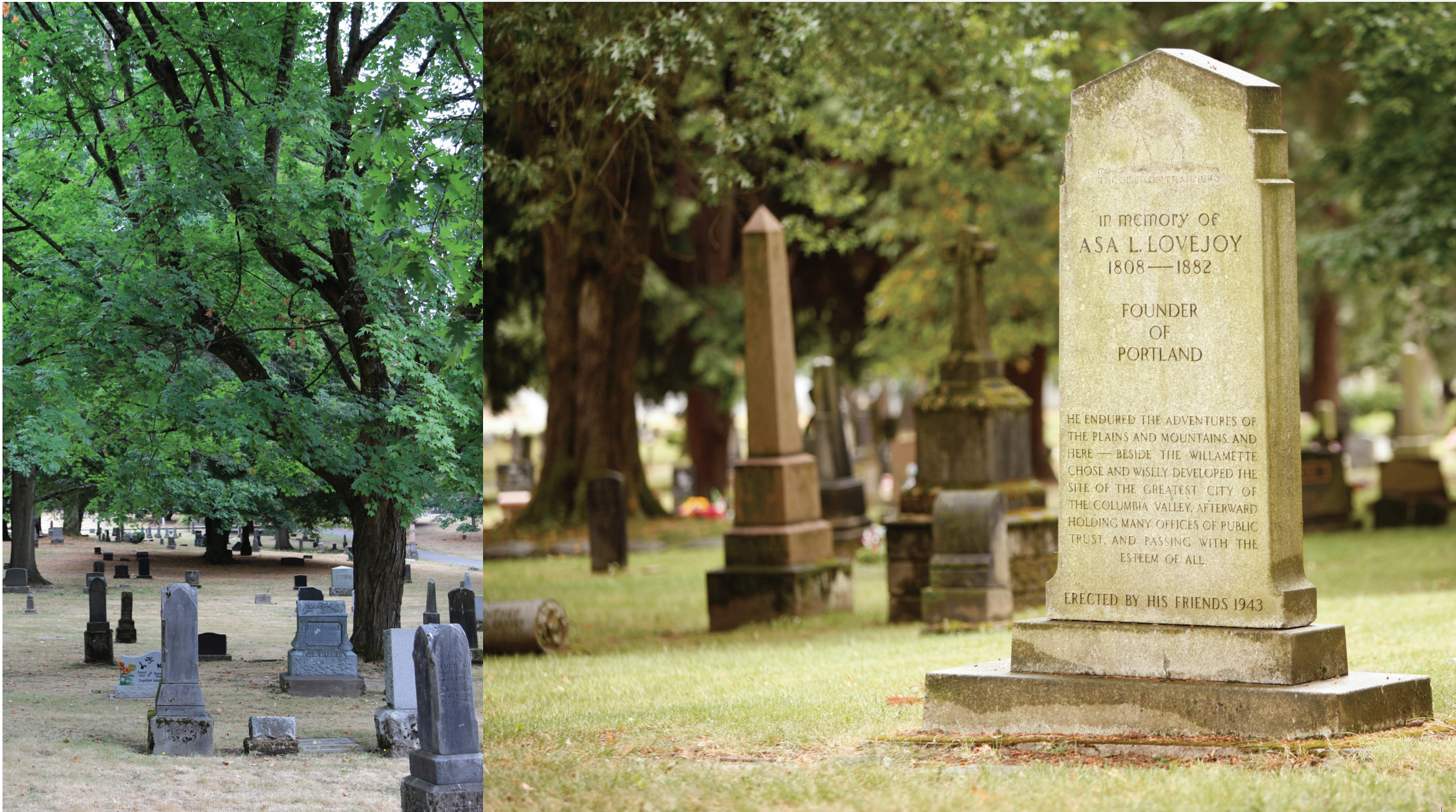
Printed on recycled-content paper. 220.42

As the resting place for generations of Oregonians since the mid-1800s, Metro cemeteries are sanctuaries of life, love and memories. You’ll find beautiful groves of tall trees and quiet corners amidst busy city life. Each cemetery offers its own sense of place and peace.