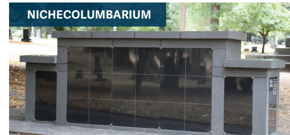
A granite structure where urns can be placed within a stone wall. Companion niches include two burial rights, estate niches include four burial rights. Prices vary based on placement. Companion niches: Bottom row $3,775. Middle row $4,395. Top row $4,625. Estate niches $11,250.