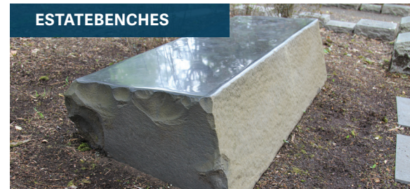
Made of columnar basalt from the Pacific Northwest, estate benches vary in size. Names can be engraved on the polished black tops. The sides are a rustic, rough edge. Urns are buried in the ground behind each bench. Small bench for four urns $9,495, Medium bench for six urns $11,250. Large bench for eight urns $13,750.