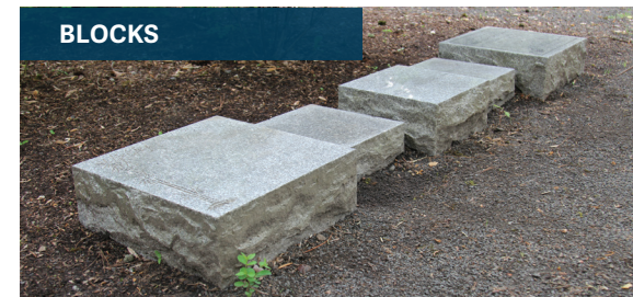
A gray granite with a rustic, rough edge measuring 12" wide x 4" high x 12" deep. Urns are buried in the ground behind the blocks. $3,495