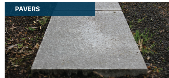
Unpolished gray granite 24" x 12". Urns are buried in the ground behind the paver. $2,500

Each of the following comes with two or more burial rights and can be engraved for an extra fee: