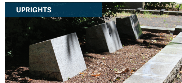
Polished gray granite stones with rustic edges 18" wide x 11" high x 10" deep. Urns are buried in the ground behind the stone. $4,395