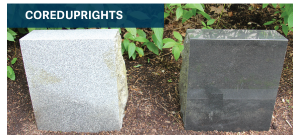
Black or gray granite stones with rustic edges 12" wide x 21" high x 18" deep. Urns are placed inside the stone. Gray stone $4,995. Black $5,295.