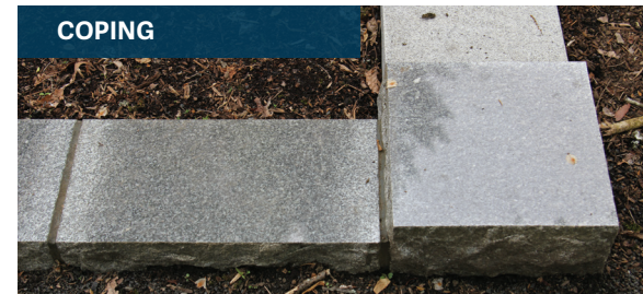
A low granite wall of polished gray granite with a rustic, rough edge. Some coping are separated from the next by a band of polished black granite. Urns are buried in the ground behind each coping. Most coping measures 18" x 9", except for end posts which are at the corner of the wall and measure 12" x 12". Coping $2,695. Coping with black granite band $3,225. Coping end post $3,495.