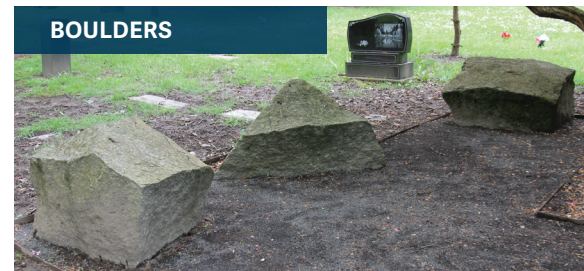
Large granite stones from local quarries that vary in size and shape. Urns are buried in the ground around the boulders. Each boulder includes four burial rights. $6,325