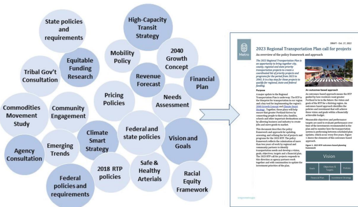
Figure 3. Elements informing the 2023 RTP call for projects

These elements come together to inform the policy framework for call for projects and provide additional information to guide how investments in roads, bridges, bikeways, sidewalks, transit service and other needs are addressed and prioritized. The elements reflect extensive engagement with local elected officials, public agencies, Tribal governments, community-based organizations, business groups and the community at large.