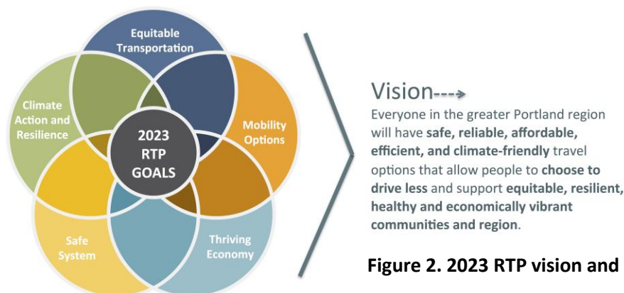
Figure 2. 2023 RTP vision and goals

The people of greater Portland have said they want a better transportation future, no matter where they live, where they go each day, or how they get there. The vision and goals, shown in Figure 2 , describe what people have said is most important to achieve with the updated RTP – more equitable transportation, a safer system, a focus on climate action and resilience, a thriving economy and options for mobility. Developed by the Joint Policy Advisory Committee on Transportation (JPACT) and Metro Council in 2022, this vision and five goals, along with other RTP policies, will guide updating the list of RTP project and program priorities.