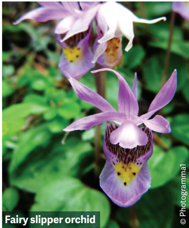
Fairy slipper orchid