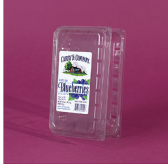
Plastic produce containers (for berries, herbs, etc.)