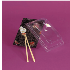
Plastic takeout containers and chopsticks