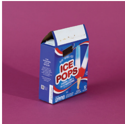
Boxes for frozen and refrigerated food