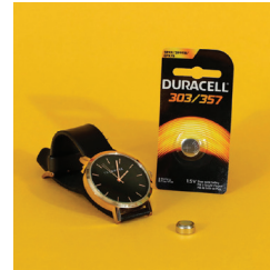
Batteries (and things with batteries in them)