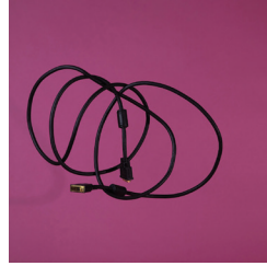
Wires, hoses, chains and electric cords