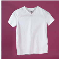
Clothes and fabric