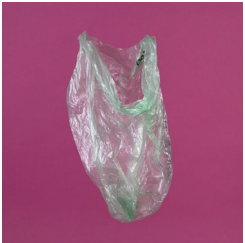
Plastic produce bags