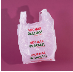
Plastic shopping bags