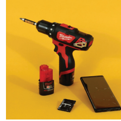
Batteries (and things with batteries in them)