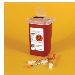
Medical sharps (syringes, needles, etc.)