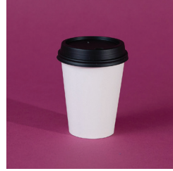
Hot drink cups (clean or dirty)