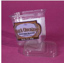
Square plastic snack containers