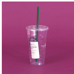
Plastic cups, lids and straws