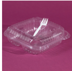
Plastic takeout containers and utensils