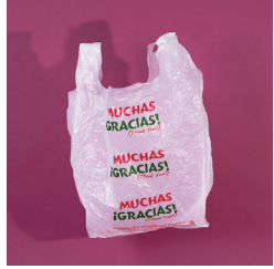
Plastic shopping bags