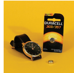
Batteries (and things with batteries in them)