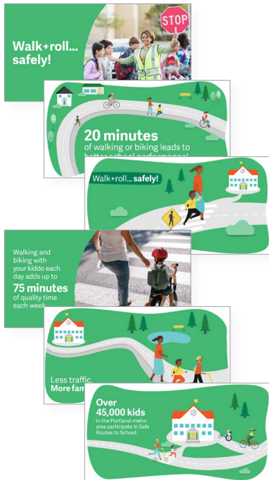
Social media share graphics