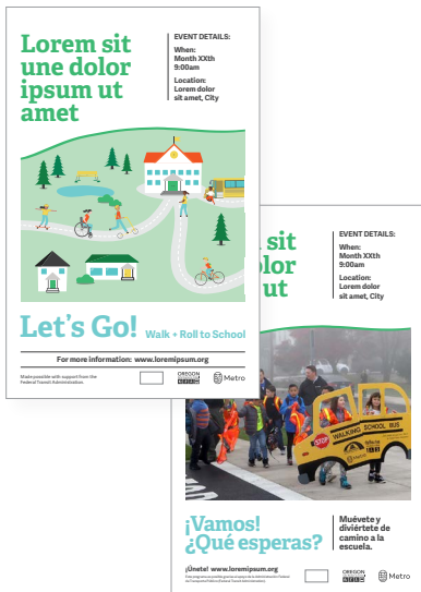
Event poster in English & Spanish