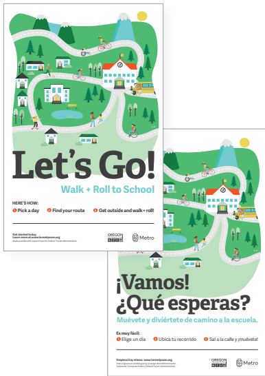
General poster in English & Spanish