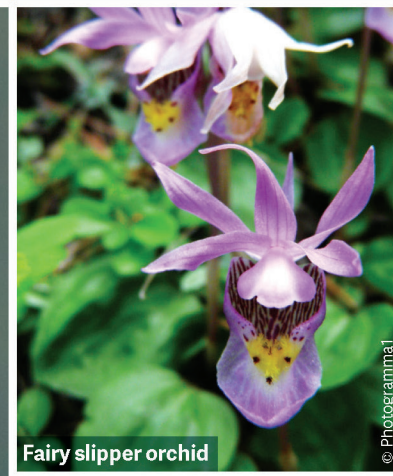
Fairy slipper orchid