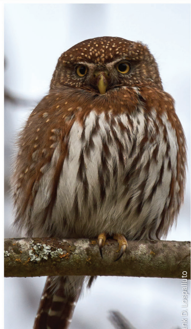
Northern pygmy owl