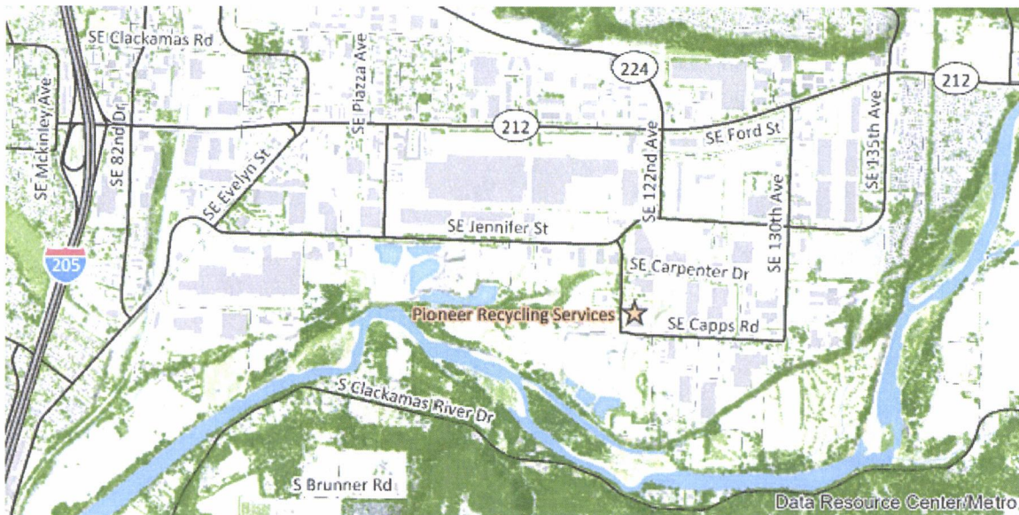
Pioneer Recycling is located at 16810 SE 120 th Avenue in Clackamas

Attached for your signature is new Solid Waste Facility License No. L-144-19 authorizing Pioneer Recycling Clackamas MRF (Pioneer Recycling) to receive and process source-separated recyclable materials at their facility located at 16810 SE 120 th Avenue in Clackamas (Metro District 2). This memo provides background information on the applicant’s request and recommends that Metro issue a new license to Pioneer Recycling to accept and process source-separated recyclable materials.