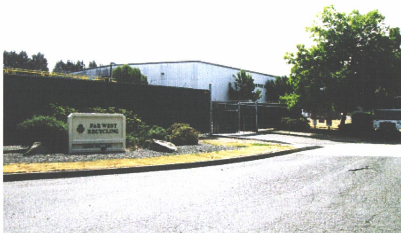
Far West Recycling is located at 12820 NE Marx Street in Portland

The applicant, Far West Recycling, is a locally owned and operated recycling facility located at 12820 NE Marx Street in Portland. The facility has operated in that location since 1993. The facility's parent company, Far West Fibers, also owns and operates a similar facility in Hillsboro that is subject to the same authorization and operating requirements. Both facilities receive source-separated residential and commercial recyclables, including corrugated cardboard, plastics, metals, and electronics, for classification and baling for both domestic and international markets.