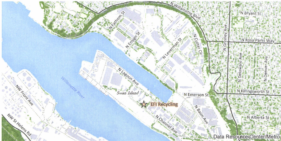
EFI Recycling, Inc. is located at 4325 N Commerce Street in Portland

Attached for your signature is new Solid Waste Facility License No. L-151-19 authorizing EFI Recycling, Inc. (EFI) to receive and process source-separated recyclable materials at their facility located at 4325 N. Commerce Street in Portland (Metro District 5). This memo provides background information on the applicant's request and recommends that Metro issue a new license to EFI to accept and process source-separated recyclable materials.