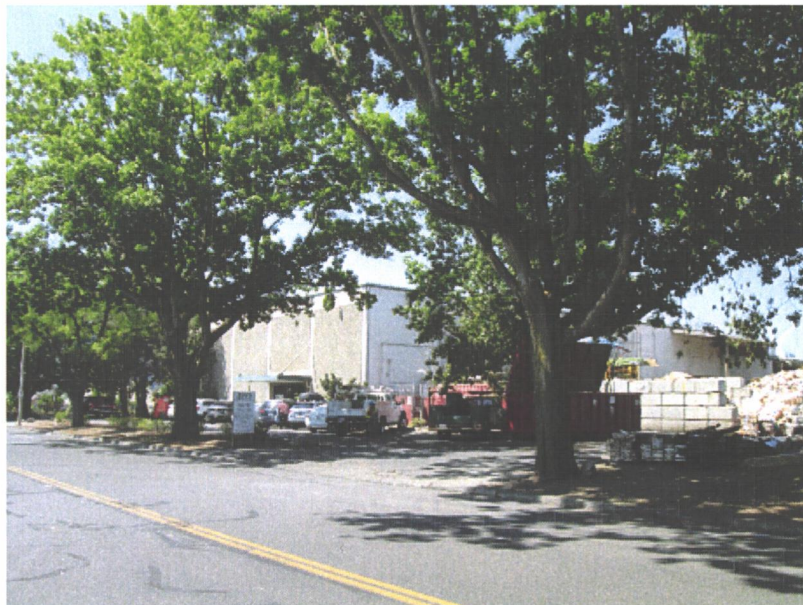
EFI Recycling, Inc. is located at 4325 N Commerce Street in Portland

The applicant, EFI, is a locally owned and operated recycling facility located at 4325 N. Commerce Street in Portland and has been in business at that site since 2001. The facility receives commercially