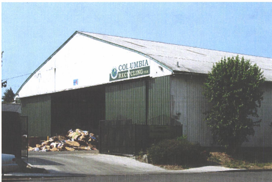
Columbia Recycling is located at 11402 NE Marx Street in Portland

The applicant, Columbia Recycling, is a locally owned and operated recycling facility located at 11402 NE Marx Street in Portland and has been in business at that site since 2006. The facility receives commercially generated recyclables, including corrugated cardboard, plastics, tires and metals, for classification and baling for both domestic and export markets.