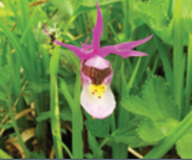
FAIRY SLIPPER ORCHID