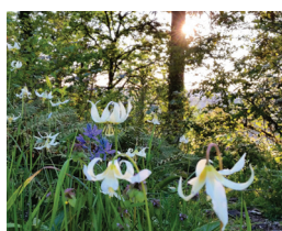
common camas and white fawn lilly