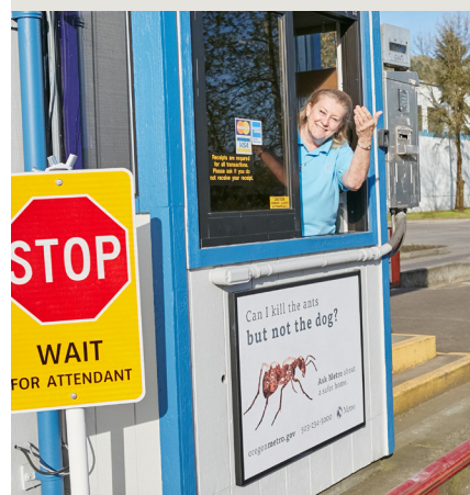
A Metro employee waves a garbage truck forward at Metro Central transfer station.

To enrich our communities and support our economy, Metro operates the Oregon Convention Center, Portland Expo Center and Portland's 5 Centers for the Arts.