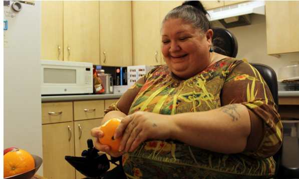
Leading with racial equity improves opportunities and outcomes for all historically marginalized communities in greater Portland.

Addressing the many disparities that stem from institutionalized inequity and exclusion will require much more than aspirational statements. That's why, in 2016, the Metro Council approved its Strategic Plan to Advance Racial Equity, Diversity and Inclusion.