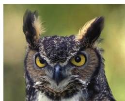
great horned owl