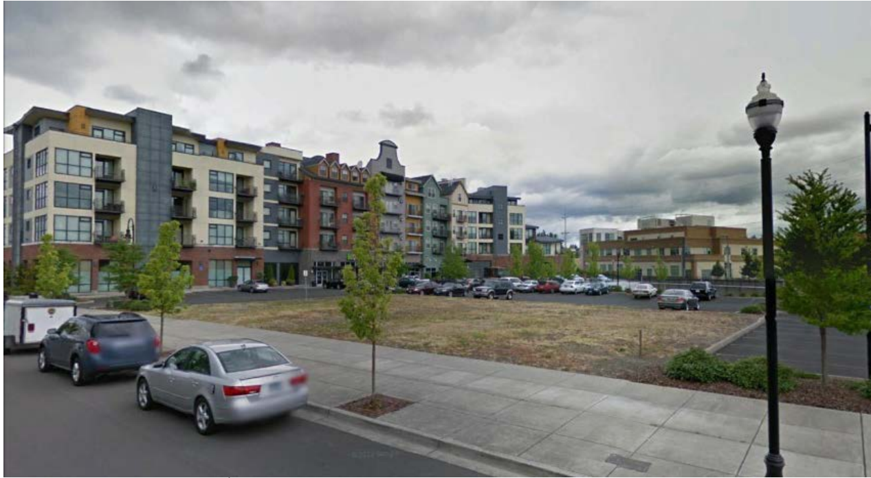
Looking north from NE 13 th Street