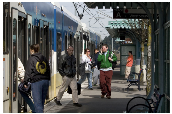
The Southwest Corridor is the last major travel corridor in the region without light rail service.

If the study determines that your property could be impacted by the light rail project, you will be contacted before designs are final. For example, changes to existing driveways may be needed. We will discuss these and other possible changes with those who may be affected.