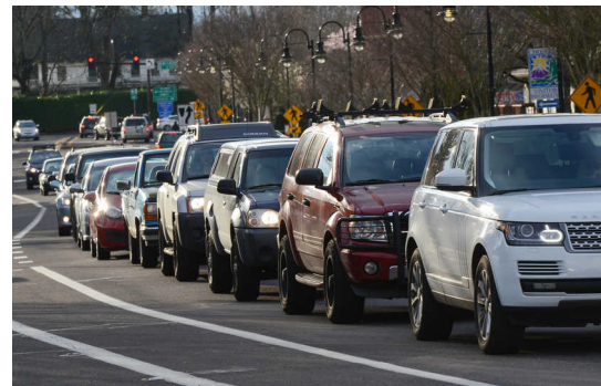
Southwest communities are growing—adding to strain on roads, transit and trails.