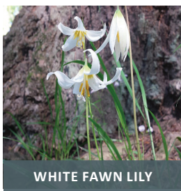
WHITE FAWN LILY