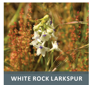
WHITE ROCK LARKSPUR