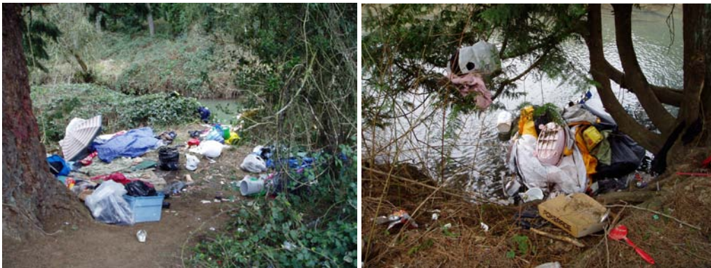
Illegal campsites along the Springwater Trail and in Johnson Creek