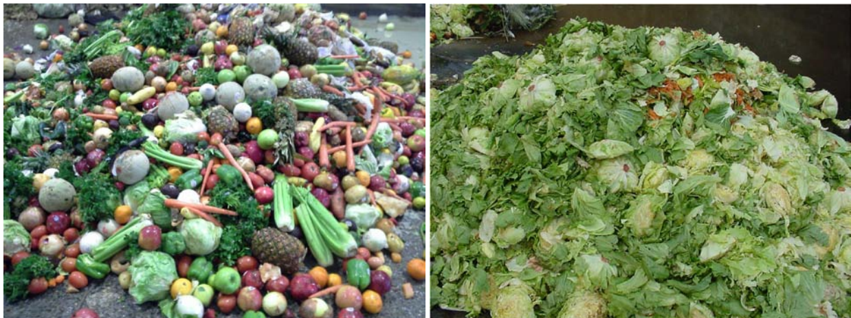
Clean food waste load and very large food waste salad