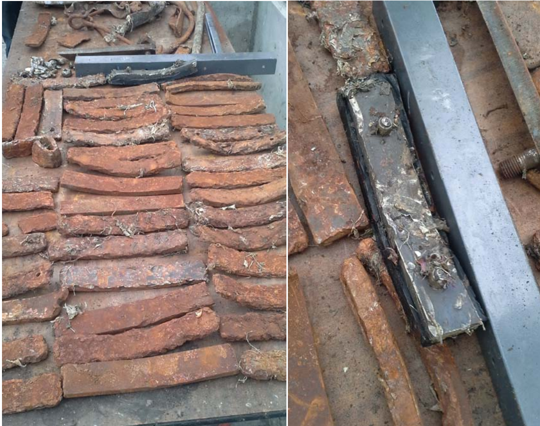
Steel plates and close-up