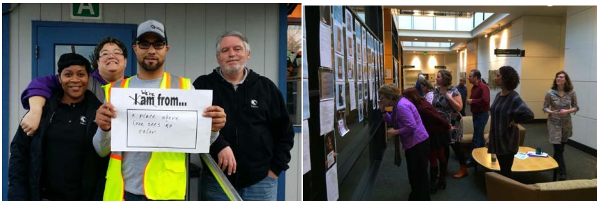
“I am from” team example and lobby display