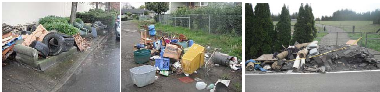
Illegal dumpsites in NE and SE Portland; illegal roofing dump in Corbett