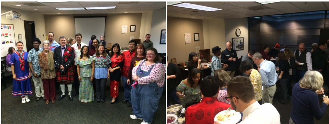
Cultural expression through attire and food on Diversity Expression Day