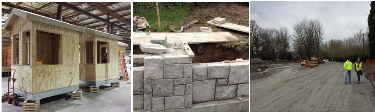
One of the new booths to be installed at the Blue Lake entry, stone wall installation at entry, construction of entry