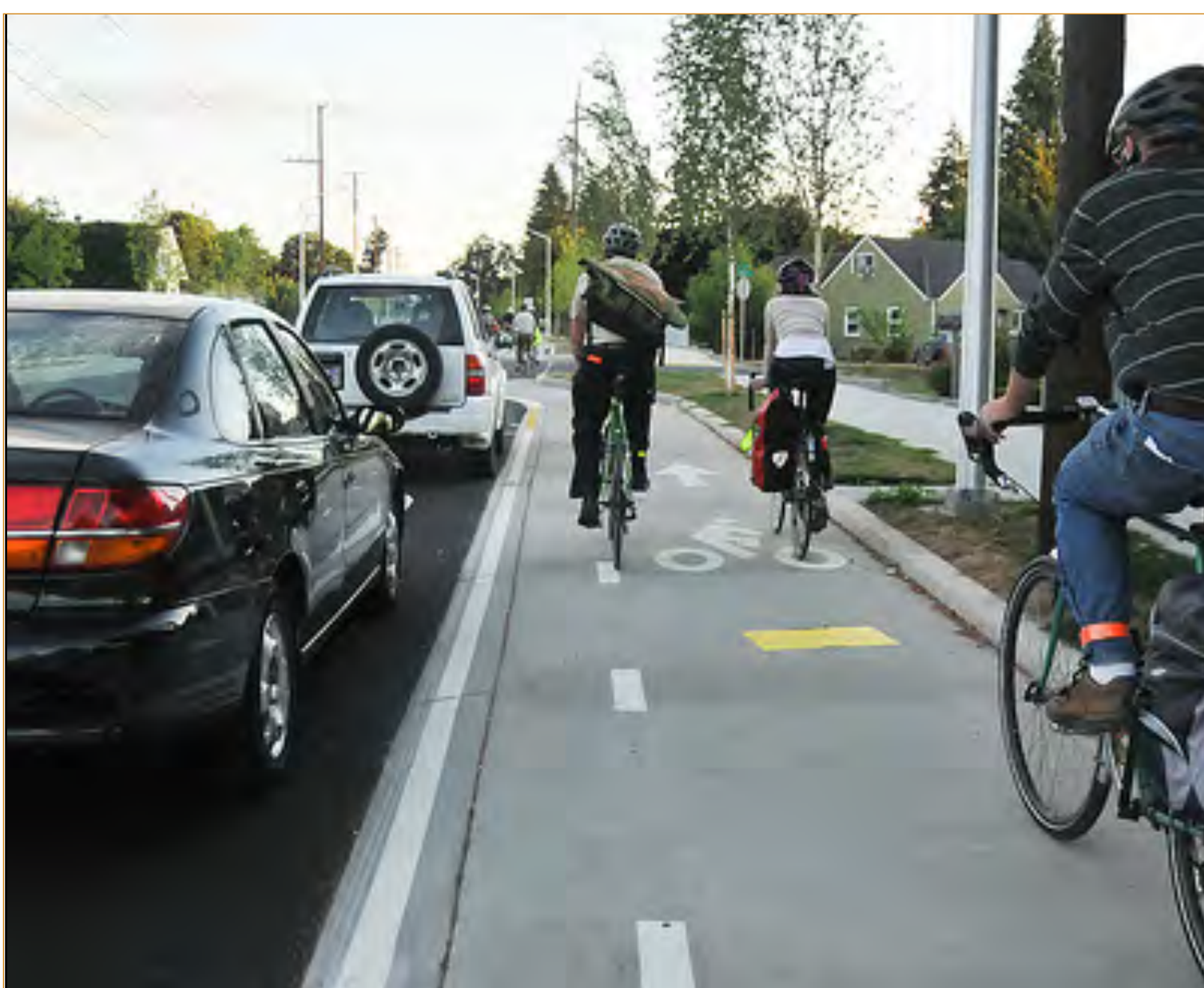
20 miles of physically Separated cycle tracks