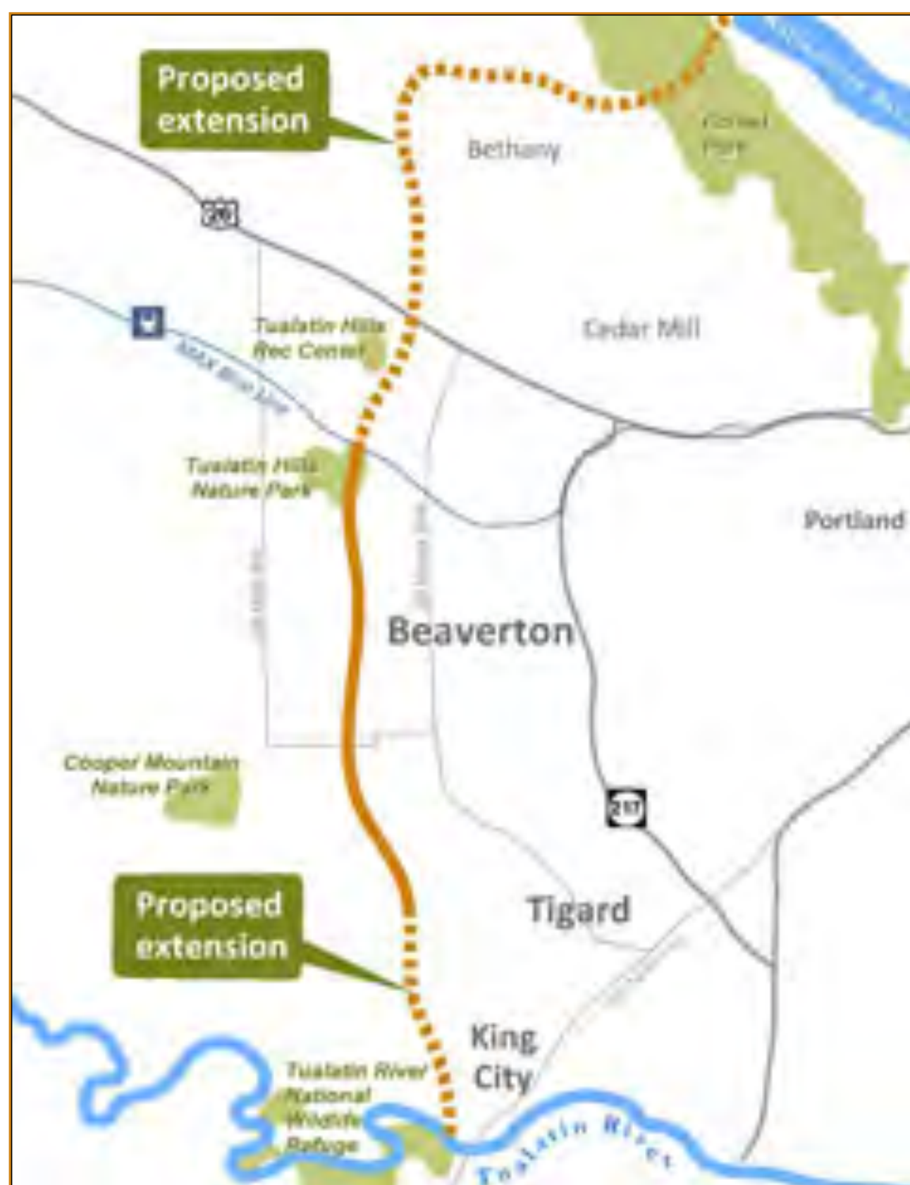
The Westside Trail