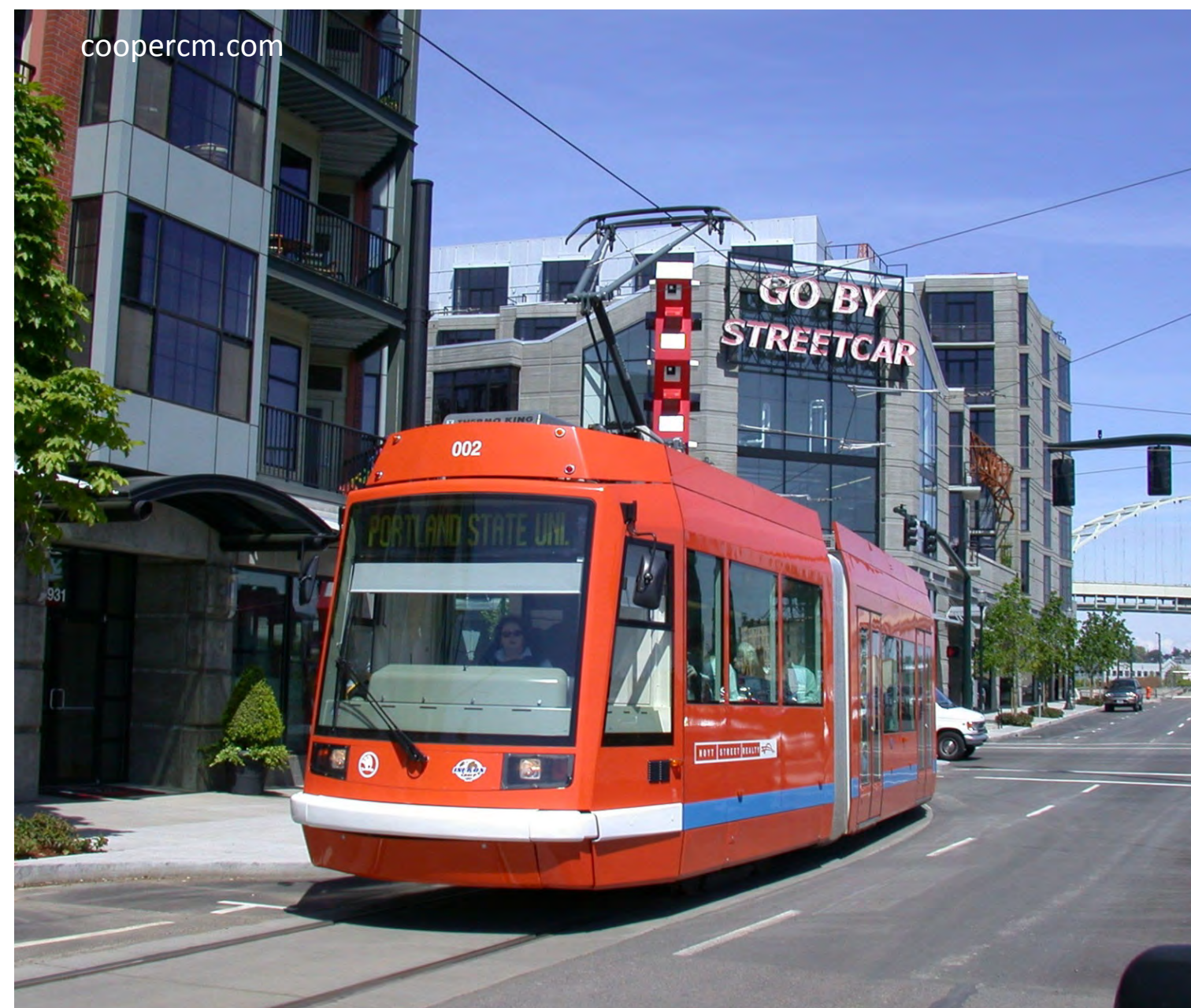
2.5 miles of streetcar track