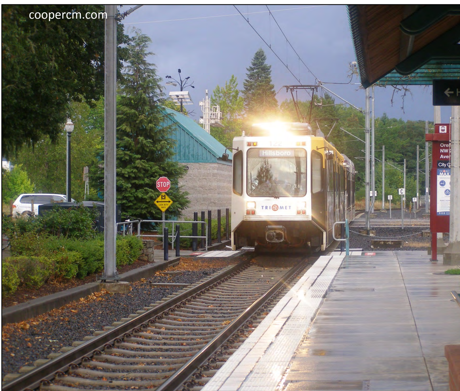
A half mile of MAX light rail line