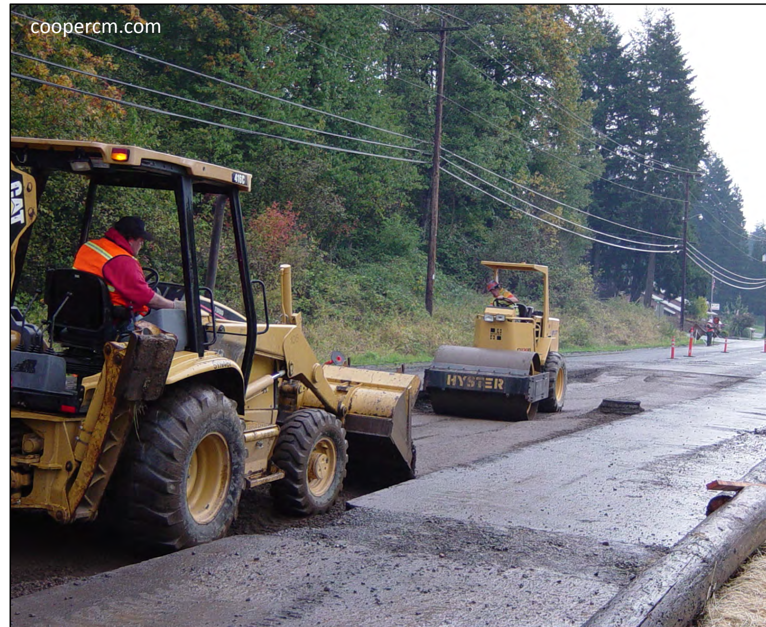
One mile of street widening