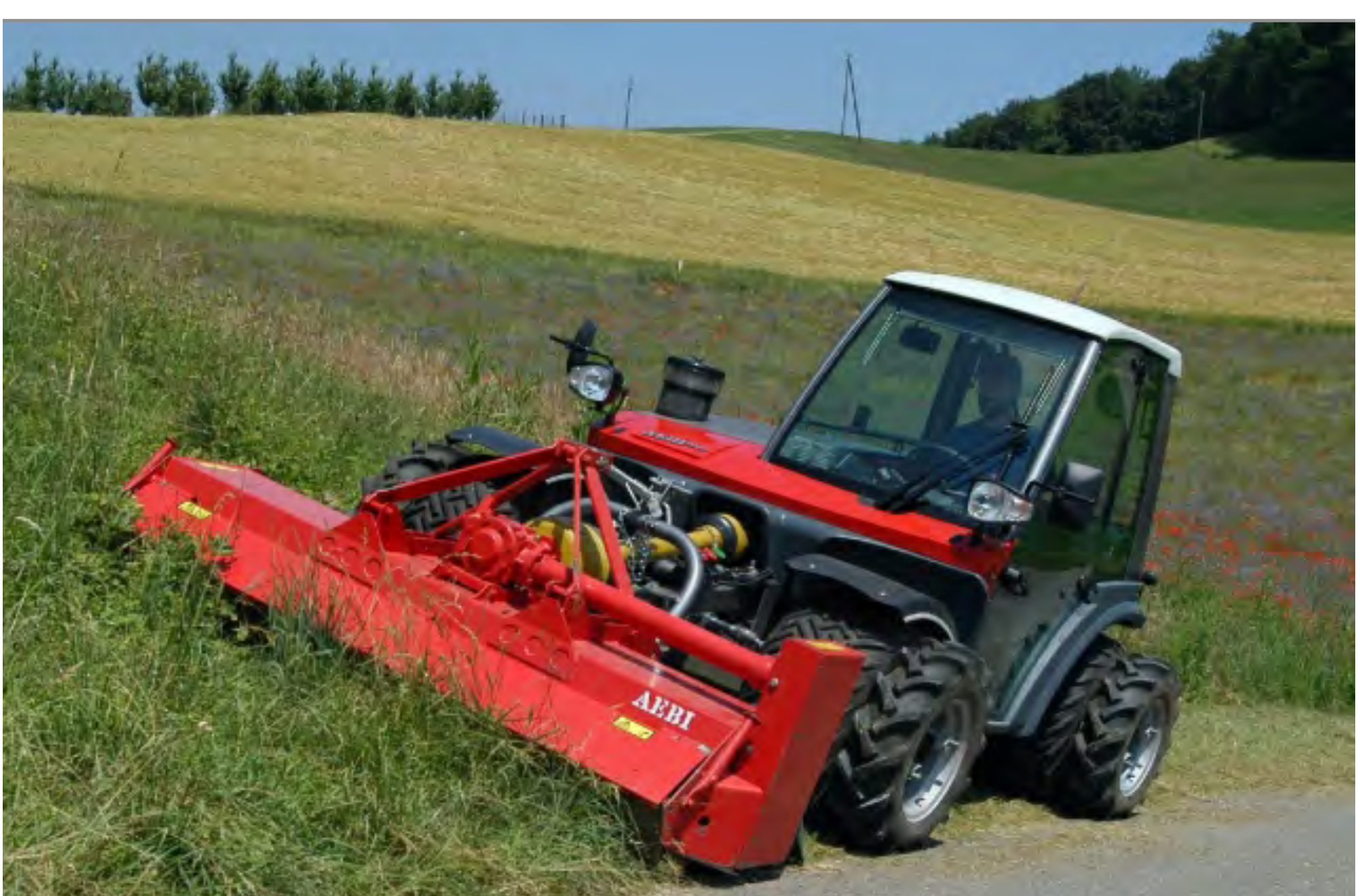
Hardy native plants can reduce maintenance costs