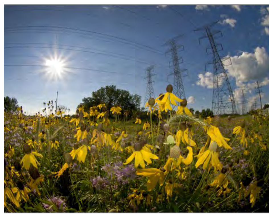
Power line corridors can be used for trails, people, plants and animals