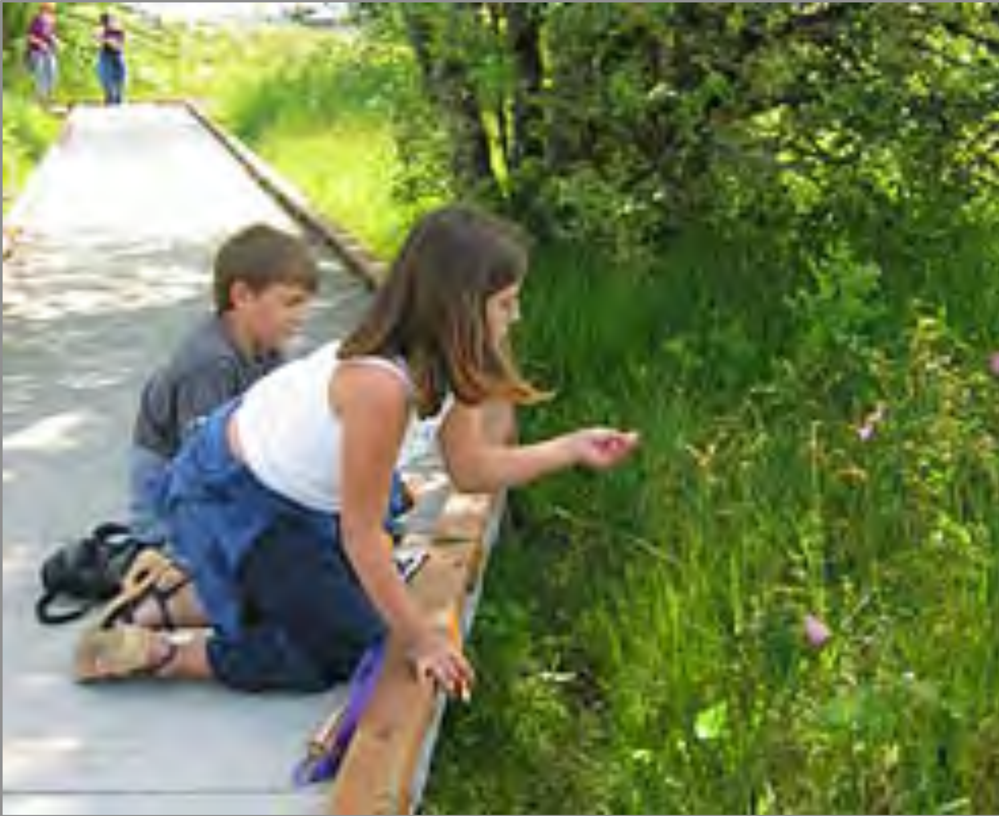
People can connect with nature