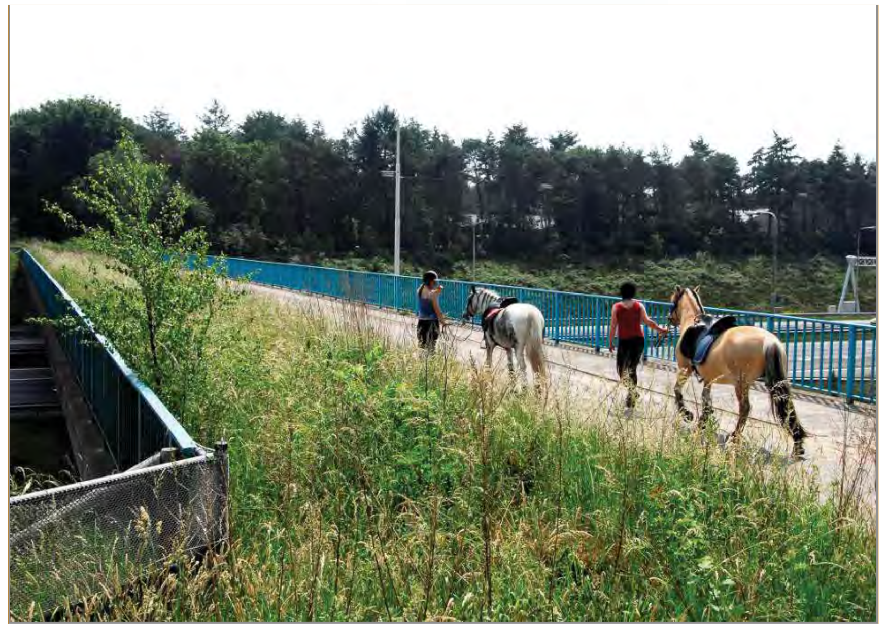
Habitat for wildlife can be created on bridges and highway crossings