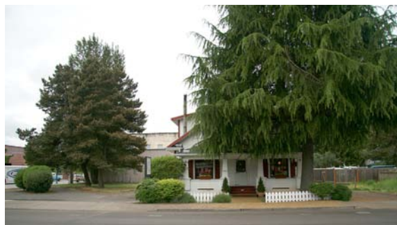
Metro brownfields program site: street view