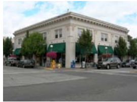
Historic downtown Sherwood